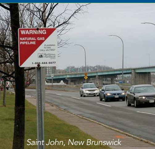
Saint John, New Brunswick

Professionals in our Gas Control Centre constantly monitor the flow of gas along the entire length of the pipeline so as to detect pressure loss on the system. In the unlikely event that a rapid or significant pressure loss is detected in an urban area, the valves upstream and downstream of the incident will be closed immediately, limiting the amount of natural gas that could be released.